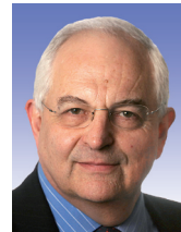
Martin Wolf The Financial Times