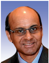
Tharman Shanmugaratnam Minister for Finance Singapore