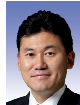
Hiroshi Mikitani Rakuten Inc.