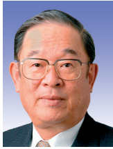
Fujio Cho Toyota Motor Corporation