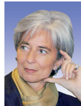
Christine Lagarde Minister for Economy, Industry and Employment of France