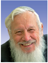
Robert John Aumann The Hebrew University of Jerusalem