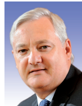
Peter R. Voser Royal Dutch Shell plc.