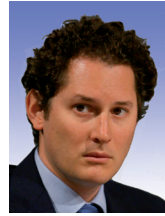
John Elkann Fiat S.p.A.