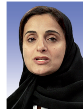
Sheikha Lubna bint Khalid Al Qasimi Minister of Foreign Trade United Arab Emirates