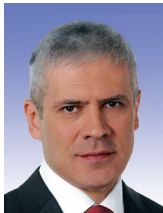
Boris Tadic President Republic of Serbia