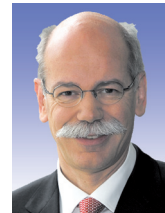
Dieter Zetsche Daimler AG