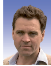
Niall Ferguson Harvard University