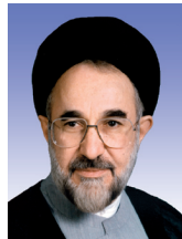
Seyed Mohammad Khatami Former President Islamic Republic of Iran