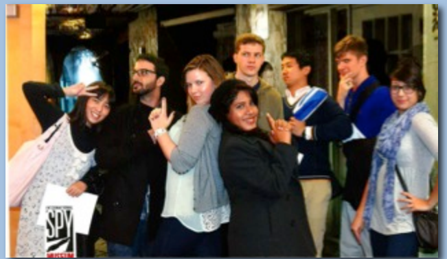
The International Fellows posing at the International Spy Museum.

The first three days of the International Fellows' stay in Washington, DC was a resounding success. CSPC would like to thank Toyota International for its support of the two Dr. Shoichiro Toyoda Fellows and the Dr. Scholl Foundation for its support of our five Fellows from Brazil, Canada, Mexico, and Spain.