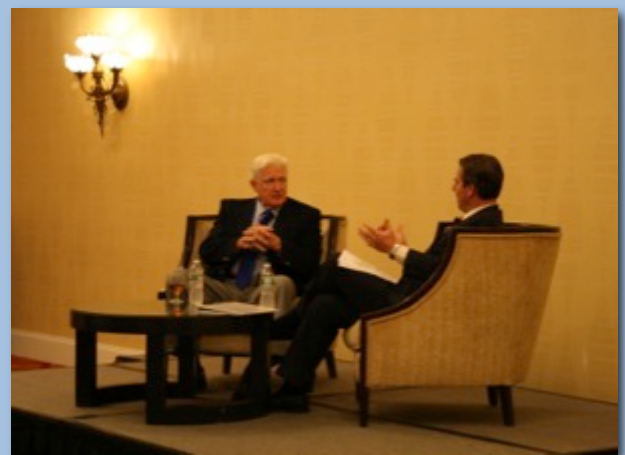
Ambassador Stuart Holliday (right) interviews Congressman James Moran (left) about his experiences working in Congress.

Friday ended with a discussion from Mr. David Walker, former US Comptroller and CSPC trustee. He talked at length about many problems currently facing the US, especially the ongoing economic issues. He engaged the students about possible solutions to these problems, and encouraged them to continue their paths into public service.