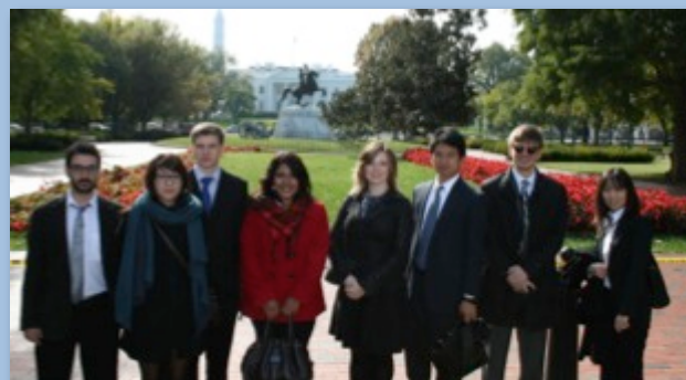
The International Fellows with the White House and Washington Monument in the background.