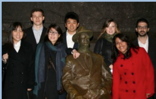
The International Fellows posing with a statue of President Roosevelt at his memorial.

During the weeks leading up to the Fall Leadership Conference, the federal government was shut down, threatening to hamper the activities planned for the International Fellows. Thankfully, the situation was resolved enough to ensure a successful week of meetings, lectures, and tours of our nation's capital for our seven foreign scholars, most of whom were visiting the United States for the first time.