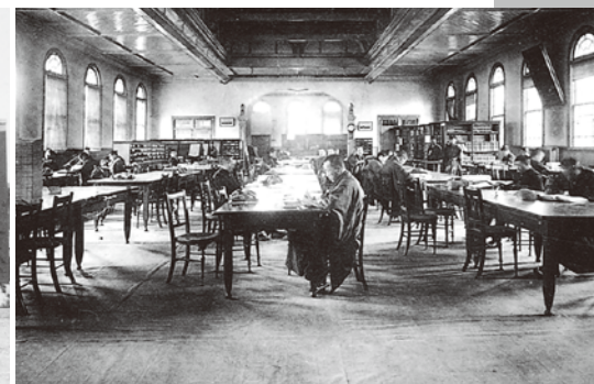
The university library in the Meiji period (circa 1909)