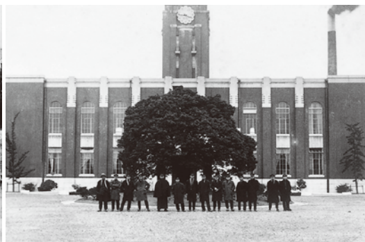
Students in front of the university clock tower (circa 1928)