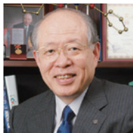
2001 Chemistry Ryoji Noyori