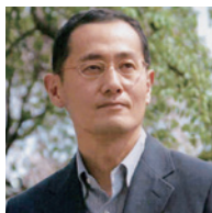
2012 Physiology or Medicine Shinya Yamanaka