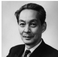
1965 Physics Sin-itiro Tomonaga