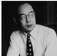
1949 Physics Hideki Yukawa