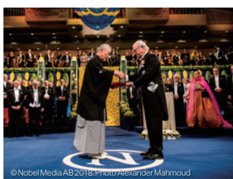
Dr. Tasuku Honjo, distinguished professor and deputy director-general of the Kyoto University Institute for Advanced Study (KUIAS), receiving the 2018 Nobel Prize in Physiology or Medicine.