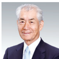
2018 Physiology or Medicine Tasuku Honjo