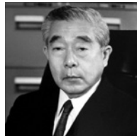
1981 Chemistry Kenichi Fukui