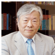
1987 Physiology or Medicine Susumu Tonegawa