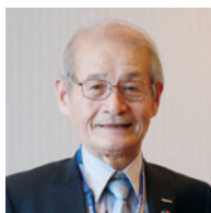
2019 Chemistry Akira Yoshino