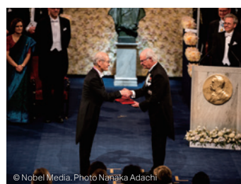
Dr. Akira Yoshino, honorary fellow of Asahi Kasei Corporation, professor at Meijo University, and alumnus of Kyoto University, receiving the 2019 Nobel Prize in Chemistry.